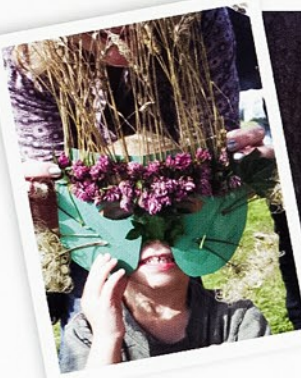
Above: Bee Display, Woodfest, New Addington Left: King's Wood Open Day

Visit the ACCS website www.accs-croydon.co.uk or contact the Community Partnership Officer at Croydon Council 020 8726 6900.