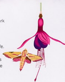
Above: Elephant Hawk Moth & Fuchsia flower Left: Peacock Butterfly on Buddleia

Some parks offer toilet and café facilities and there is a range of sports that can be played, including the UK's first disc golf course in Lloyd Park.